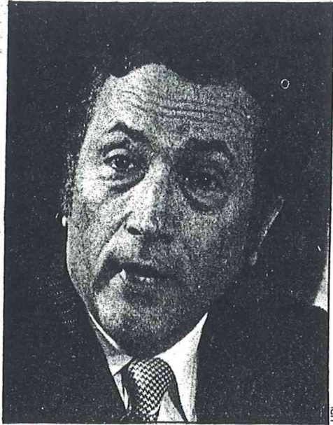
Cuban Premier Fidel Castro is an obvious target for investigation, but U. S. Senator Richard Schweiker (right) is asking questions and may hold first open hearings on the JFK murder.

Senate Select Committee on Intelligence granted Schweiker his mandate—a two-man subcommittee, with Colorado Senator Gary Hart, to explore the probability of an intelligence agency cover-up during the Warren Commission investigation. That made theirs the first government body since the